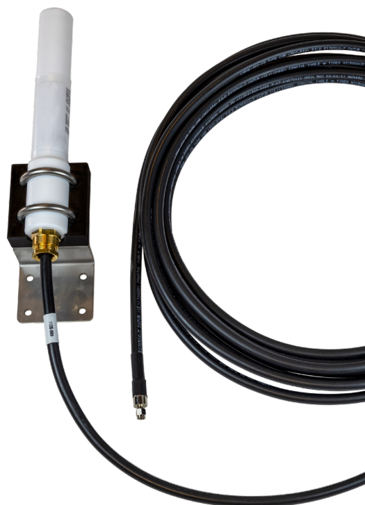
Differences may occur due to requirements