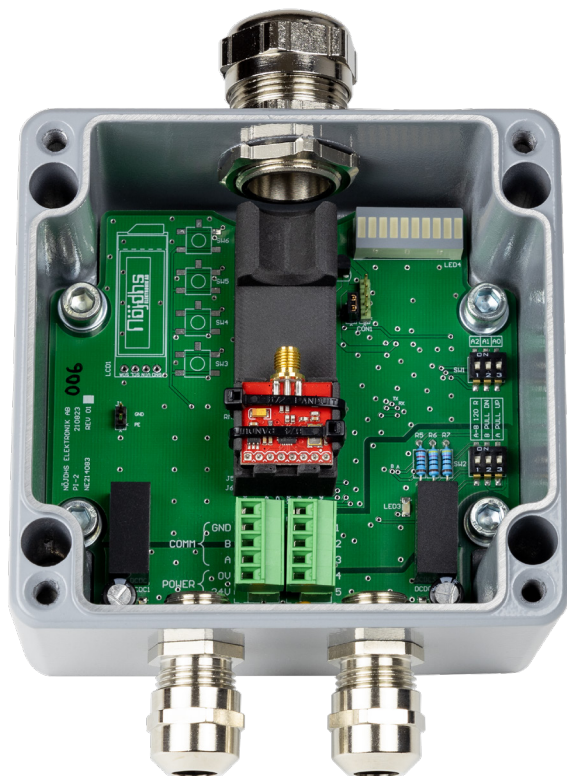
Differences may occur due to requirements