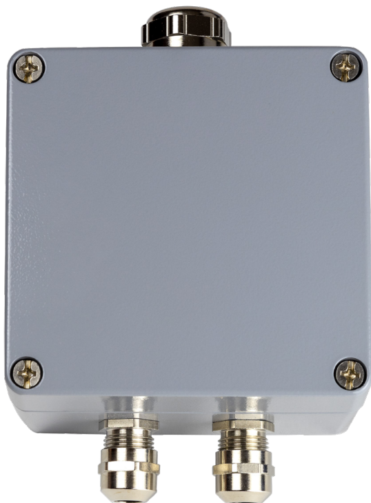
Differences may occur due to requirements

Two Probe Interfaces outside each battery compartment can be used if a higher redundancy is required or if the configuration of the battery compartment demand that.